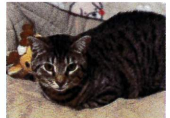
Fig (short for Figaro)- a wonderful gal who lost her left eye when she was a kitten. She was relinquished by her owner last year and now is ready for the forever home that she deserves. She rolls over to have her belly petted and likes to be brushed. She is 10 years old and is considered "special needs" because she is on Fluoxetine. However, she is a sweet girl who is looking for someone to spoil her with love!

Yasmine -a delightful 1 year old tabby girl who is quiet and reserved at first, but she responds very well when petted and given attention. She loves to nap in the cubby of the cat tower but has become more social with the volunteers and comes out to play. She and her sister were rescued from a hoarding situation in January 2025. Her sister was adopted a few months ago, and now she's hoping it's her turn!